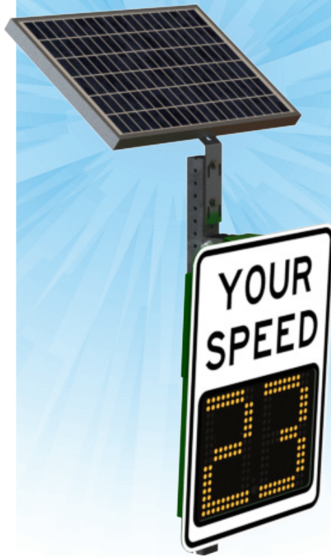
Part #: M75-009SE-000x