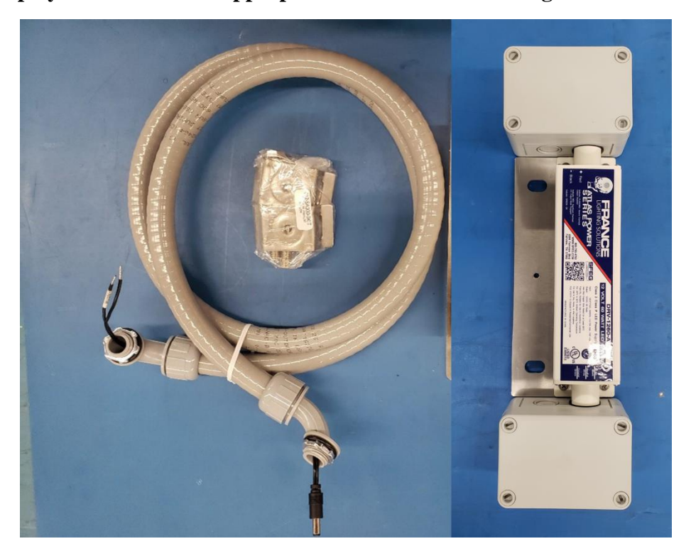
Figure 1 - Parts included for connecting the power supply.

Note: These instructions are in addendum to the instructions found in the LED Driver Feed Back and Wrong Way Alert Controller Installation Instructions. Please refer to those instructions for display installation and appropriate cautions and warnings.