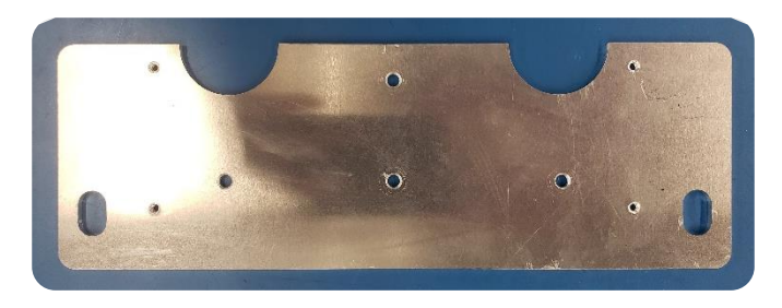
Figure 2 - Mounting Plate Detail

For easier installation, a mounting plate is included with required hardware to mount the power supply to the plate. Ensure the power supply is mounted with the DC side (output) mounted over the engraved arrow (see image below). Note that the power supply can be mounted on its edge or on the flat to accommodate several installation scenarios, decide which mounting orientation is best for your system by mock fitting the components before installing.