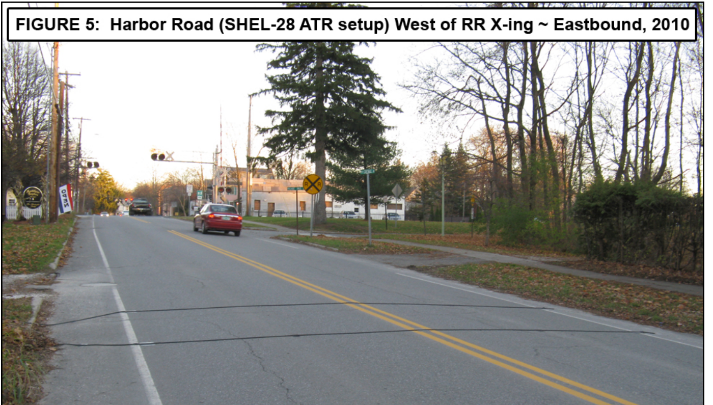
FIGURE 5: Harbor Road (SHEL-28 ATR setup) West of RR X-ing ~ Eastbound, 2010

ATRs were setup in 2010 and 2012 at GMPC Pole #6 between Athletic Drive and the Railroad crossing on Harbor Road, about 350 ft. east of where the radar feedback sign was eventually installed in 2012 (see Figure 5 ). This is the exact position where each of the ATRs were installed for both count periods.