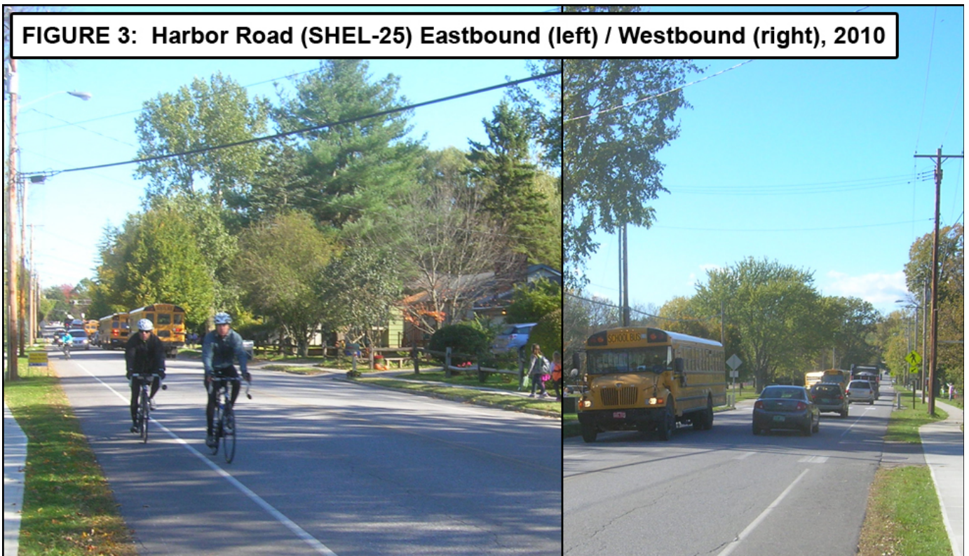
Figure 3 illustrates the school zone traffic just after school had been dismissed for the afternoon. Although pedestrians had been observed to consistently use the sidewalks (left), there were also a high number of bicyclists and school busses sharing the road, which ensured low traffic speeds during this time-period. The 2006-2012 ATR installations were setup on the 1 st telephone pole shown in the eastbound view of Figure 3 , and in the westbound view in Figure 4 ,