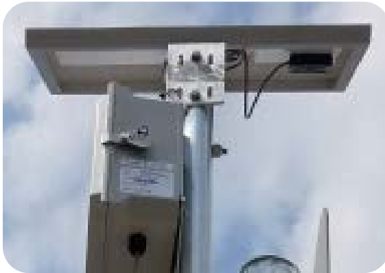
example of solar setup, from the ground

Where solar power is utilized, ensure that the solar panels are south-facing and angled at 45° (off of level). A calculation typical to solar installation can be utilized to measure an exact angle specific to your latitude.