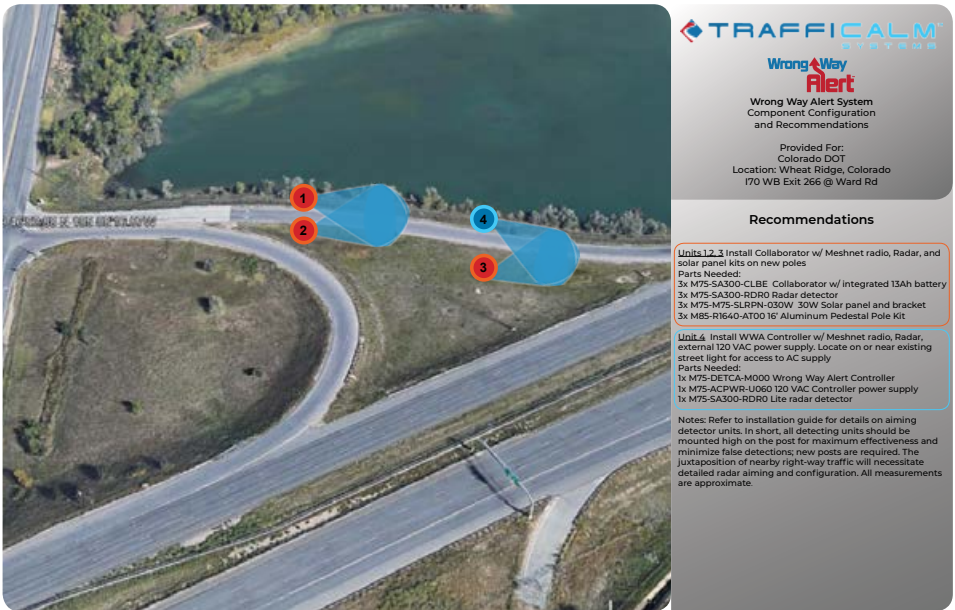
example of design guide/pictorial

In anticipation of your project we supplied design guides (example shown below) that itemized the hardware used per specific road section (typically a ramp) and per post. This guide is critical to the success of the installation and should be available for reference during the planning and installation phases. After the installation, this guide can be referenced during maintenance and, if needed, repair.