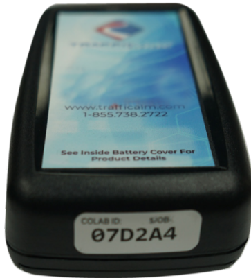
Illustration 1.1 - M75-SABRA-000T Toggle Fob with ID shown at a sharp angle

One common application this proves useful in is where flashing signs can be activated to warn drivers they need to “chain up” in snowy pass conditions. An operator can activate the system for as long as necessary and then deactivate it from the comfort of a snow plow (assuming snow plows afford some comfort to the operator)