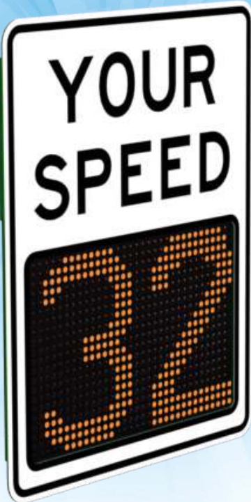
Part #: M75-12DFB-P00x