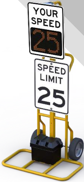
Part #: M75-9IDFB-D0xx

The TrafficCalm™ Portable Series of Radar Driver Feedback Signs offers solutions for increasing driver speed awareness and road safety along with the flexibility of a portable system. This dolly mounted sign features bright 9" characters which can be seen from up to 450' away, and help increase driver speed awareness on neighborhood streets where so many small accidents occur every year. SafetyCalm™ data collection software allows you to gather hard data of traffic patterns and program the sign to help keep streets safer. The IQ900 Dolly Mounted Portable 9" Sign offers multi-site versatility.