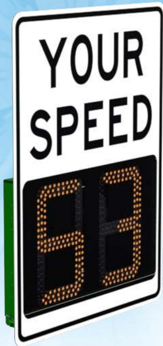
Part #: M75-15DFB-000x