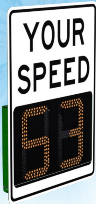
Part #: M75-15DFB-000x