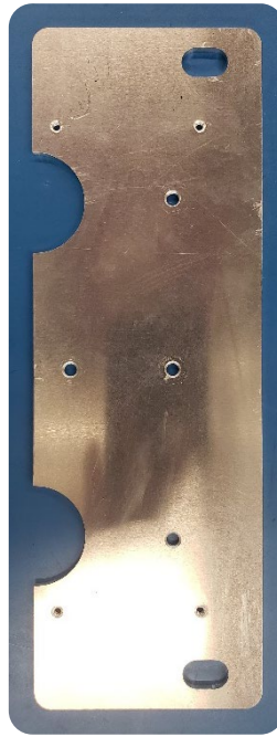
Figure 2 - Mounting Plate Detail

For easier installation, a mounting plate is included with required hardware to mount the power supply to the plate. Ensure the power supply is mounted with the DC side (output) mounted over the engraved arrow (see image below). Note that the power supply can be mounted on its edge or on the flat to accommodate several installation scenarios, decide which mounting orientation is best for your system by mock fitting the components before installing.