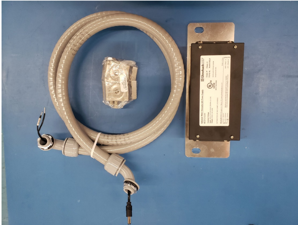
Figure 1 - Parts included for connecting the power supply.

Note: These instructions are in addendum to the instructions found in the LED Driver Feed Back and Wrong Way Alert Controller Installation Instructions. Please refer to those instructions for display installation and appropriate cautions and warnings.