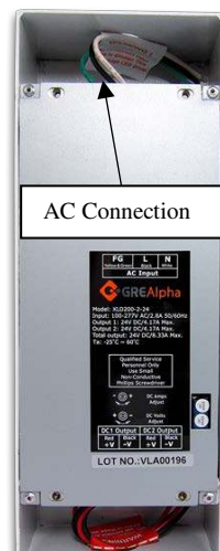
Figure 3 - AC Connection

It is recommended to use a liquid tight conduit adapter and conduit when attaching the power supply to AC power (not included). The AC input can be connected to 100-277 VAC at 50/60 Hz. On the power supply, the green wire is ground, the white wire is neutral and the black wire is line (hot). The front panel of the power supply must be removed for AC installation.