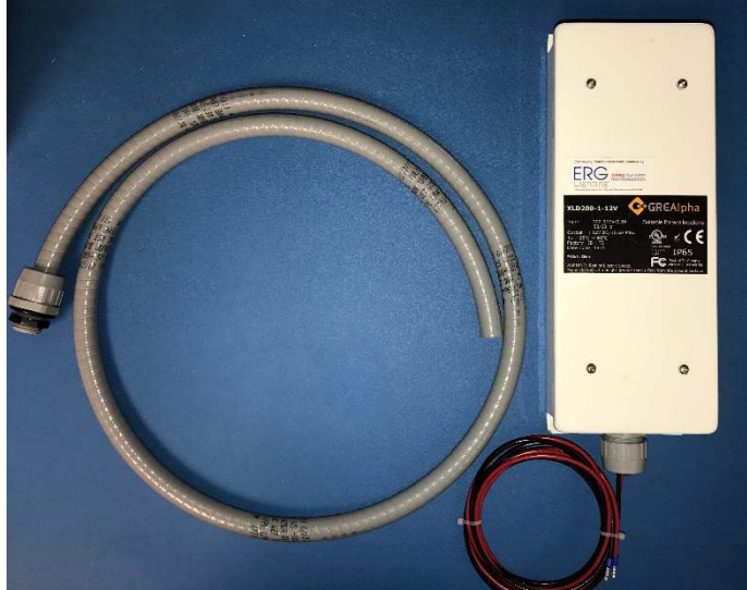
Figure 1 - Parts included for connecting the power supply.

Note: These instructions are in addition to the instructions found in the LED Driver Feed Back Installation Instructions. Please refer to those instructions for display installation and appropriate cautions and warnings.