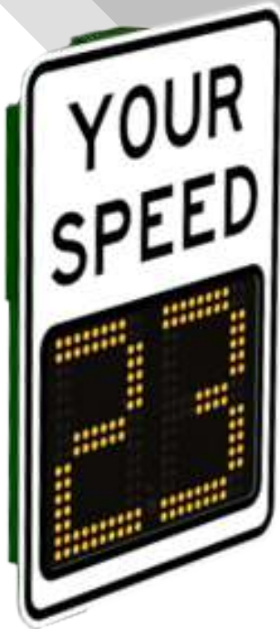
Part #: M75-09SE-PK0x