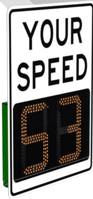
Part #: M75-15DFB-000x